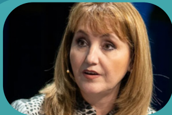
Gloria Guevara (President & CEO WTTC)

WTTC Backs GCC as a "Managed-Risk" Powerhouse: Can Global Forums Forge the World's Most Resilient Tourism Region?